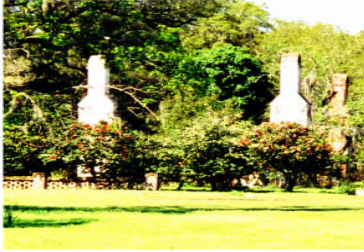
Huspa Plantation Paige's' Point Beaufort County, South Carolina

We are fortunate in our area to not only having the many resources of the Heritage Library to keep us in touch with our chosen homes but to also have access to several tours which illuminate and display the unique beauties of our region.